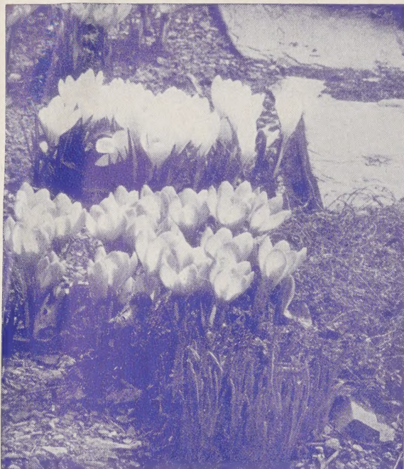
GIANT FLOWERED CROCUS